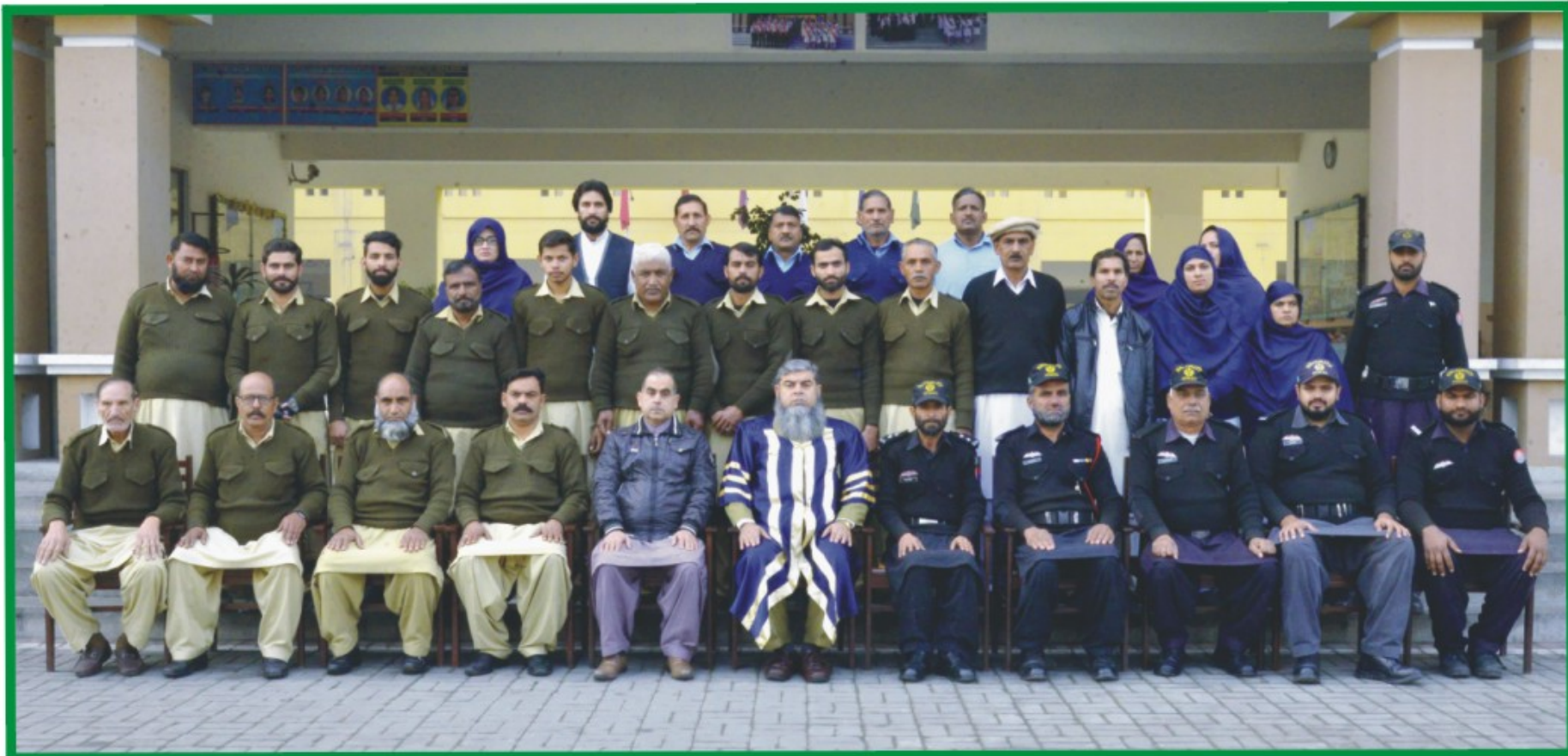
Non Teaching Staff (Transport, Security & Sanitary)