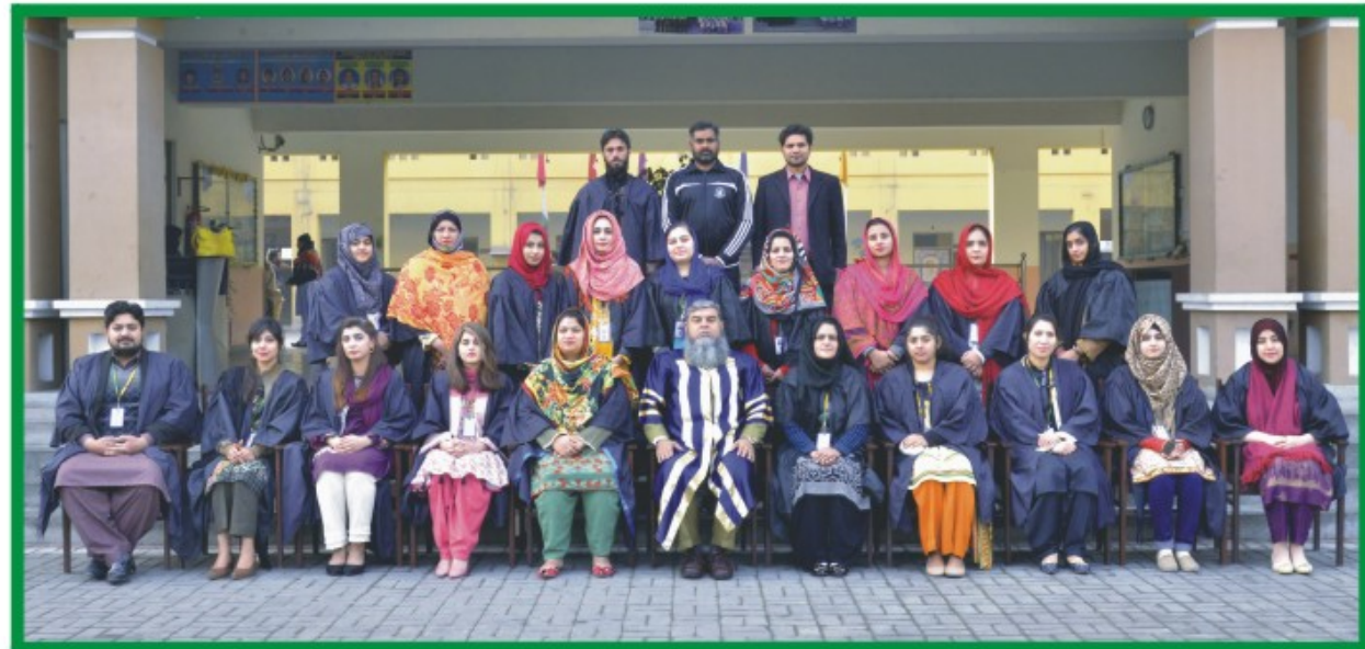
Teaching Staff (Boys wing)