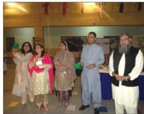
Annual Staff Dinner