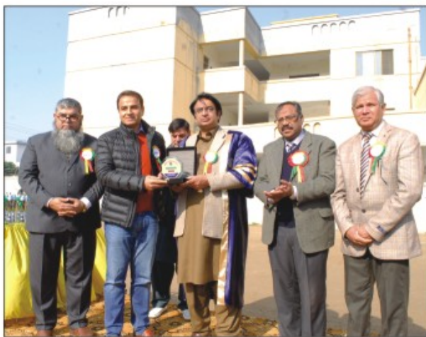
Annual Sports Day Celebration