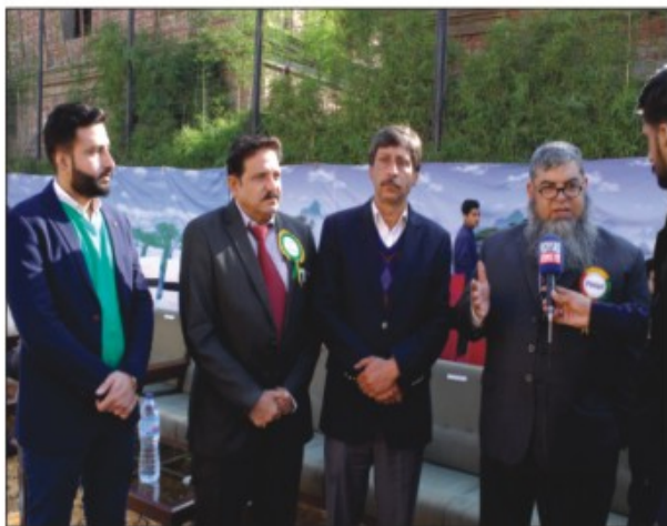
Annual Sports Day