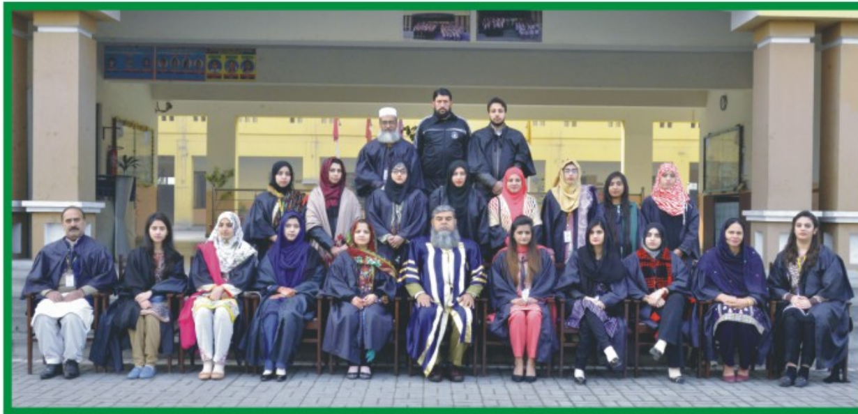
Teaching Staff (Girls wing)