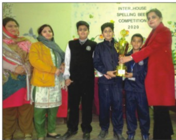
Spelling Bee Quiz