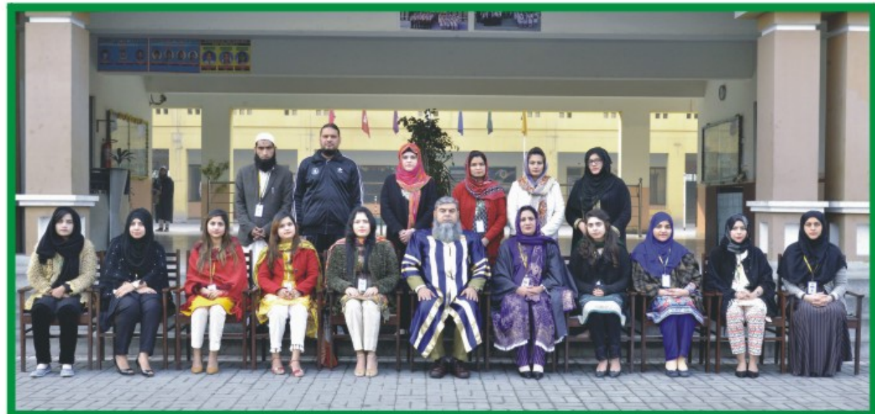
Teaching Staff Pre School