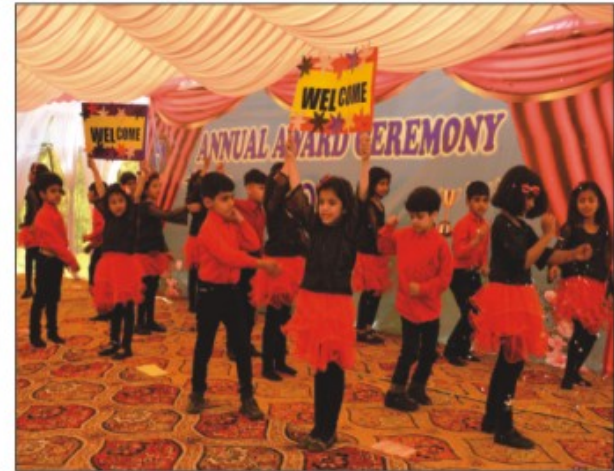
Annual Award Ceremony