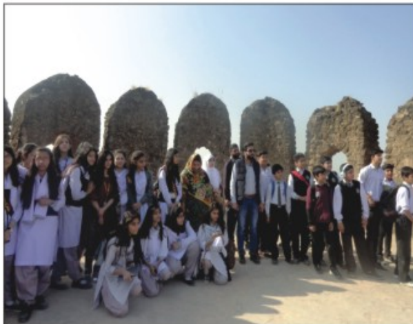
Rohtas Fort Trip